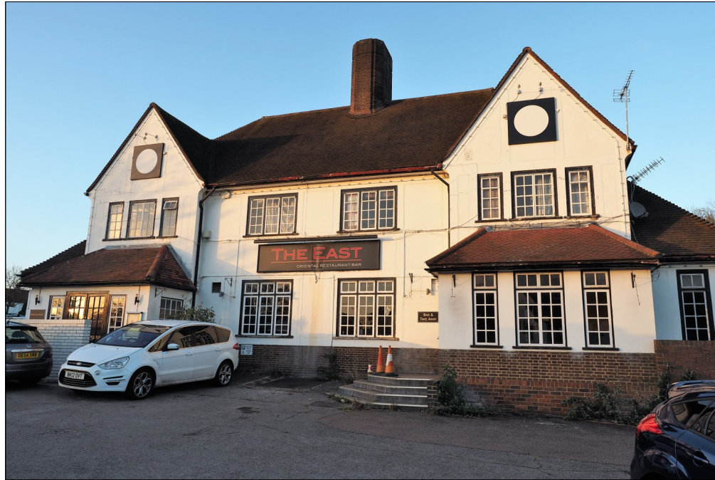
Last days of The Bull at Stanborough— see pages 18 & 20. Shoebboxes and poppies—see pages 7 & 13